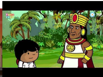
Taino, the Indian chief